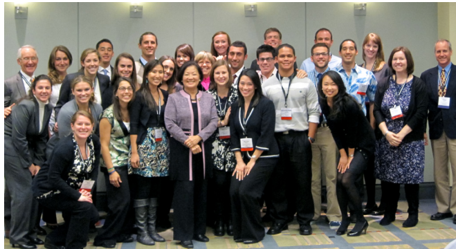
Congresswoman Mazie K. Hirono is surrounded by Teach for America teachers from Hawaii at the Teach for America 20 th Anniversary Summit held in Washington, D.C., on February 11. Thirty-one teachers represented various schools across the state, including Kealakehe High, Nanakuli High and Intermediate, Solomon Elementary, Waianae Intermediate, Waianae High, and Wheeler Middle.