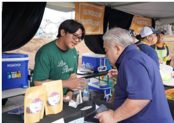
'Ilima Intermediate created a special concoction - Coconanazz, a chocolate covered banana treat!

Students in grades 6-12 showcased and sold their products on April 6 at KCC Farmers' Market as part of a program sponsored by the Hawai'i Agricultural Foundation. Profits earned go back to the schools to support future educational goals.