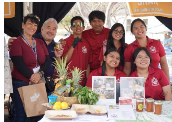
Baldwin High crafted products like dehydrated pineapple and mac nut pesto.