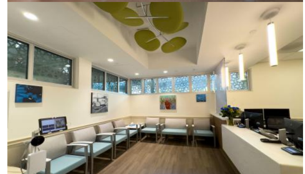
Unveiling of health center from April 10.