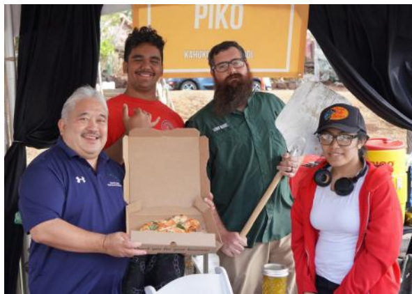
Students from Kahuku High and Intermediate served made-to-order sourdough pizza.