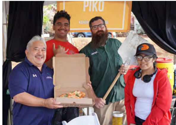
Students from Kahuku High and Intermediate served made-to-order sourdough pizza.