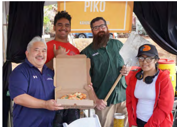
Students from Kahuku High and Intermediate served made-to-order sourdough pizza.