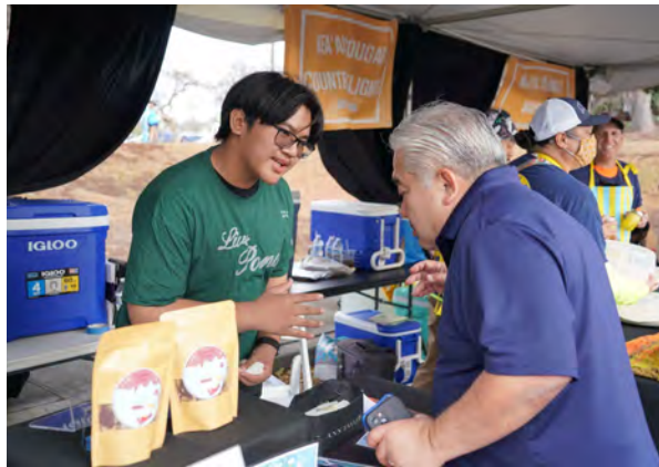
'Ilima Intermediate created a special concoction - Coconanazz, a chocolate covered banana treat!

Students in grades 6-12 showcased and sold their products on April 6 at KCC Farmers' Market as part of a program sponsored by the Hawai'i Agricultural Foundation. Profits earned go back to the schools to support future educational goals.