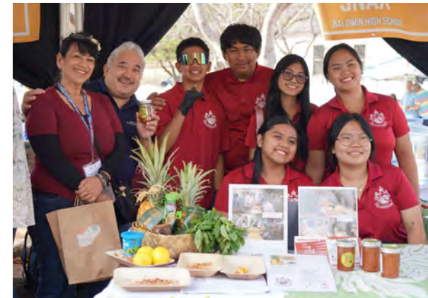
Baldwin High crafted products like dehydrated pineapple and mac nut pesto.