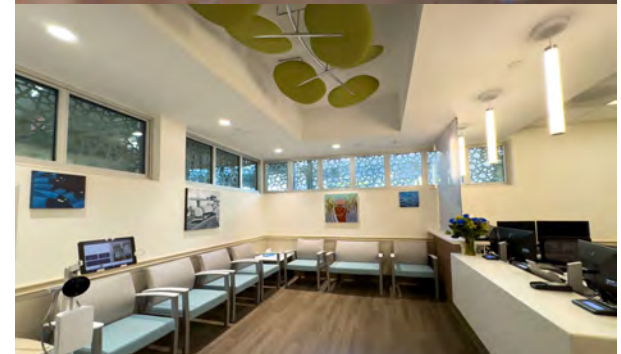
Unveiling of health center from April 10.