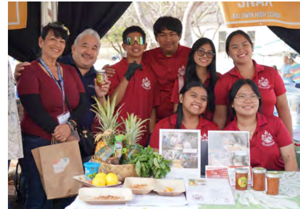
Baldwin High crafted products like dehydrated pineapple and mac nut pesto.