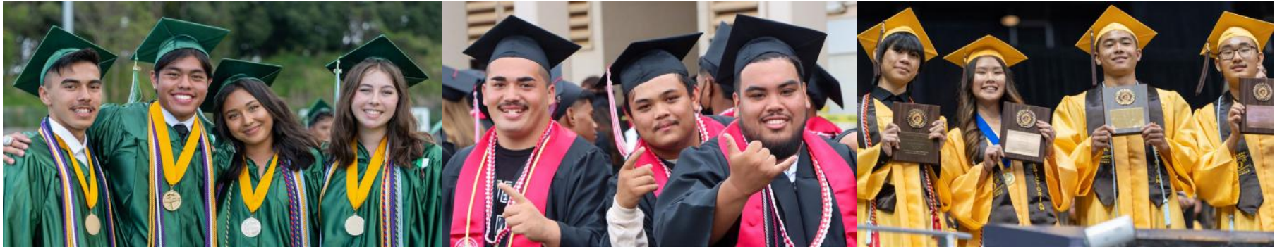
Graduates from, left to right, Konawaena, Kaua'i and Mililani high schools at ceremonies in 2023.

https://www.hawaiipublicschools.org/ConnectWithUs/MediaRoom/PressReleases/Pages/2024-Graduations.aspx