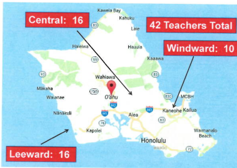
Defending America's Interests in the Indo-Asia-Pacific