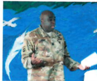
Defending America's Interests in the Indo-Asia-Pacific