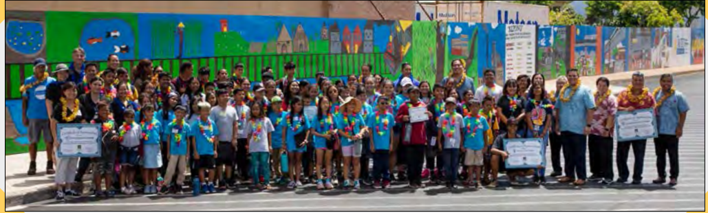
Students from Waikele Elementary, Waipahu Intermediate and Waipahu High schools were recognized for their contributions to beautify Waikele Center with vibrant murals depicting the area's past, present and future.