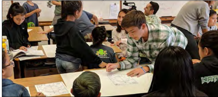
High school students help design and deliver engaging science lessons.

This school year marks the inaugural year of full Next Generation Science Standards (NGSS) implementation for Hawai'i. As a science teacher and parent, I have a hard time containing my excitement. These standards not only elevate the rigor of scientific inquiry in the classroom, but they acknowledge both indigenous and Western science practices, incorporate greater science literacy, and expand our definitions of engineering.