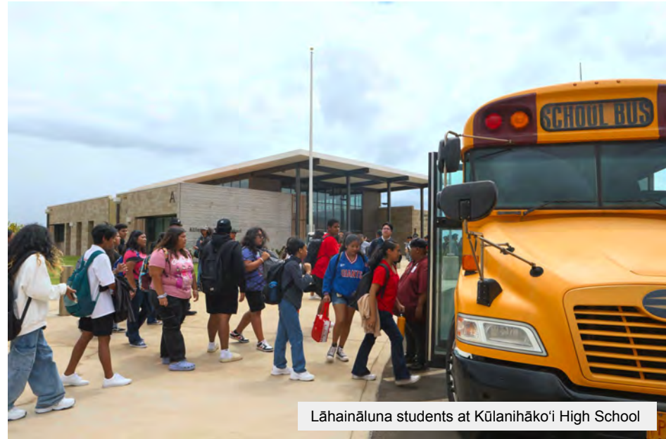
Lāhaināluna students at Kūlanihāko'i High School