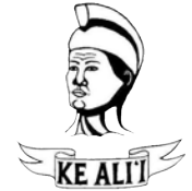
Princess Nāhi'ena'ena Elementary