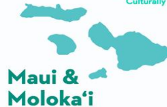
Maui & Moloka'i