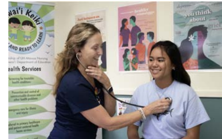
Hawaii Keiki nurse with a student at school-based clinic