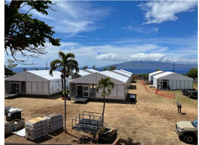
King Kamehameha III Elementary temporary structures at Princess Nahienaena Elementary. Oct. 10, 2023