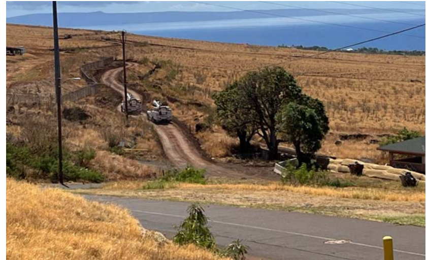
Secondary evacuation route prepared by the Department of Transportation.