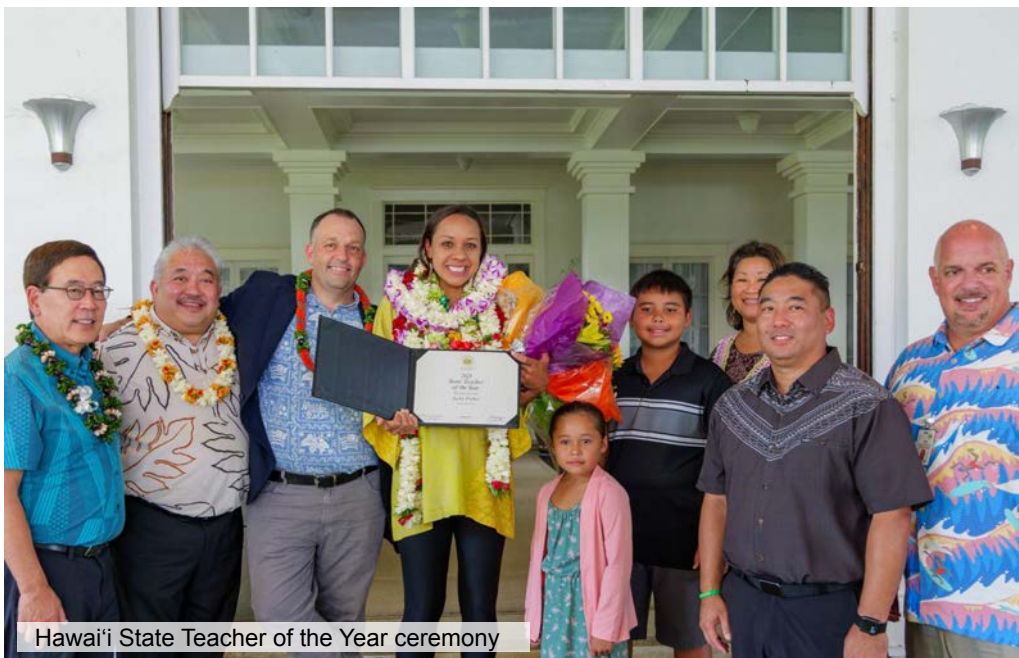
Hawai'i State Teacher of the Year ceremony