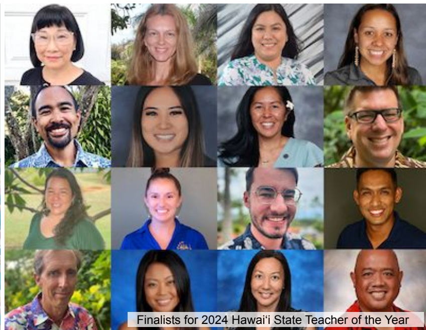
Finalists for 2024 Hawai'i State Teacher of the Year