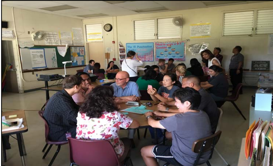
Professional Development led by our Teacher Leadership Cadre

HAWAII STATE DEPARTMENT OF EDUCATION HawaiiPublicSchools.org