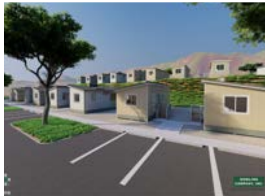
A rendering of the rental units by Dowling Company Inc.