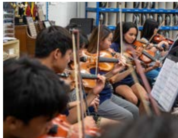
From left to right, Āliamanu Middle, Kaimukī Middle and Moanalua Middle Schools