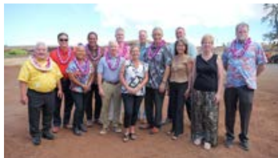
HIDEO leadership along with state and county officials attended a groundbreaking ceremony in May 2025.