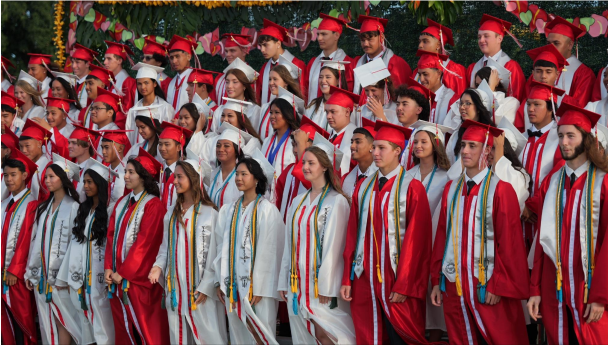
Wailua High Class of 2025 graduates get ready to receive their diplomas.

Graduation ceremonies for nearly 50 public schools statewide begin May 16 through the end of the month.