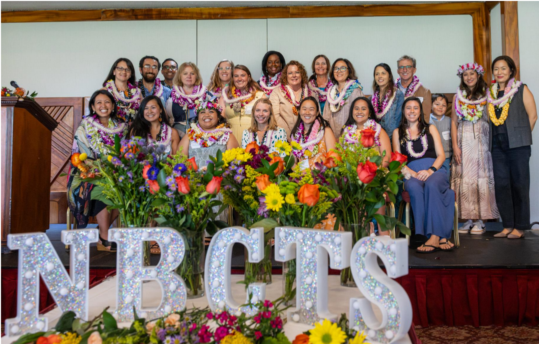
2026 National Board Certified Teachers

30 Hawai'i educators were recognized for their completion of the rigorous National Board Certified Teacher certification program.