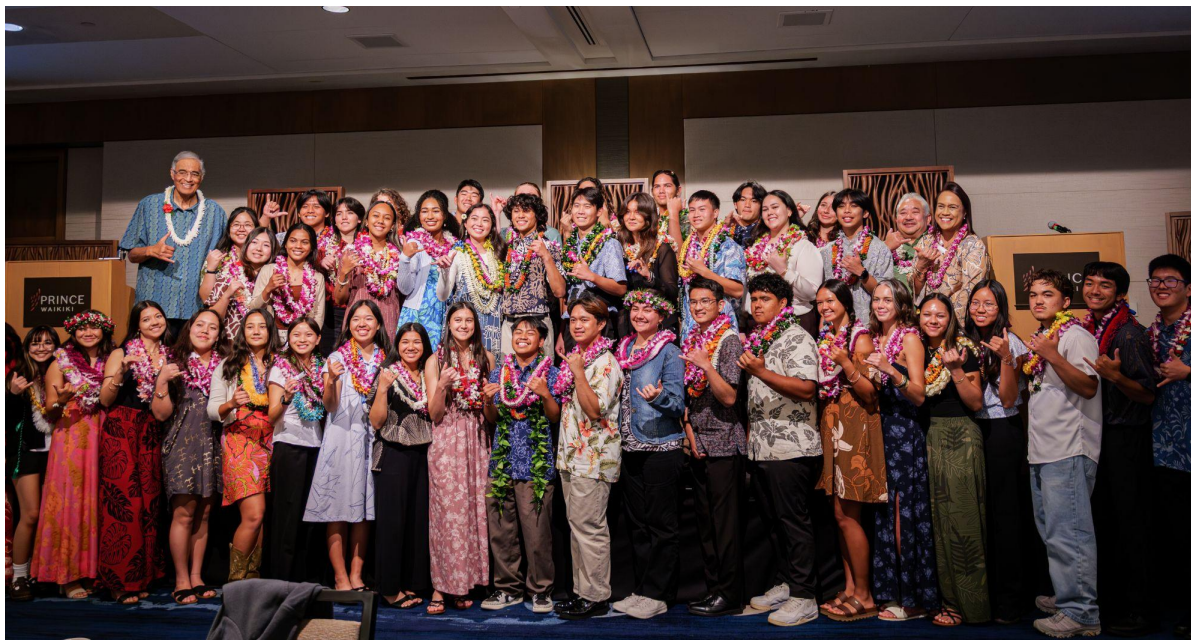
The 2026 Citizen-Scholars Award ceremony, held at the Prince Waikiki, celebrated 42 public school seniors.

For over 20 years, the Hawai'i Lodging & Tourism Association, HIDEO and the Honolulu Star-Advertiser have honored one outstanding senior from every public high school who best exemplifies citizenship in school and the community.